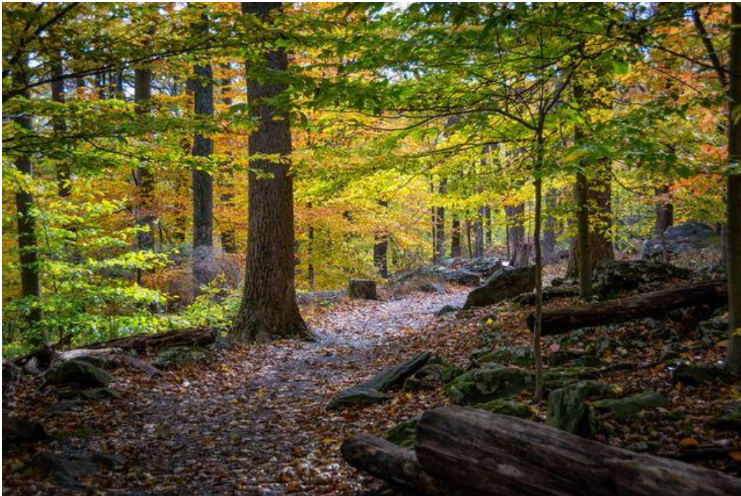
Falls Trail at Cunningham Falls State Park

CFA remains a vital group of caring individuals who are making a positive impact in our community. Please consider being an active part of this incredible service organization by joining or renewing your membership today! Remember, you may go to the CFA website: www.catocinforestalliance.org , to join or renew. You may print out, complete, and mail the filled-out form to CFA PO Box 411 Thurmont, MD 21788 with a check made out to CFA.