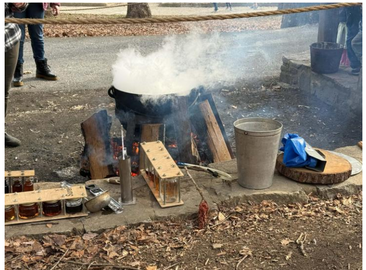
Making maple syrup