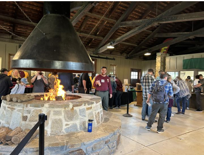
People waiting for fresh, hot pancakes with maple syrup at the Maple Syrup Festival 2026

A big shout out of thanks to all who helped in any way with the Maple Syrup Festival at Cunningham Falls State Park (CFSP) this past March. CFSP had all hands-on deck as another successful Maple Syrup Festival took place on March 14/15 and 21/22. Shelley represented CFA by volunteering both Sundays.