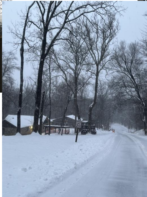
Clearing snow around the aviary and the Visitor's Center at CFSP 2/2025