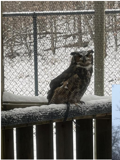
Isabella, the great horned owl, enjoys the snow at the Aviary in Cunningham Falls State Park (CFSP)