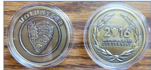
NPS Challenge coins (Obverse and reverse)