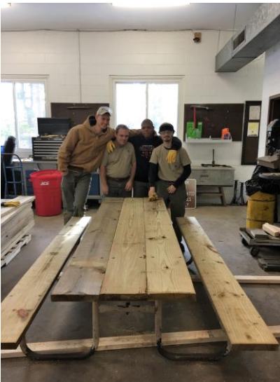
SUCCESS students master the task of building picnic tables.