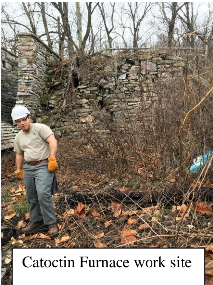
Catoclin Furnace work site

Great work by the SUCCESS students and their mentors