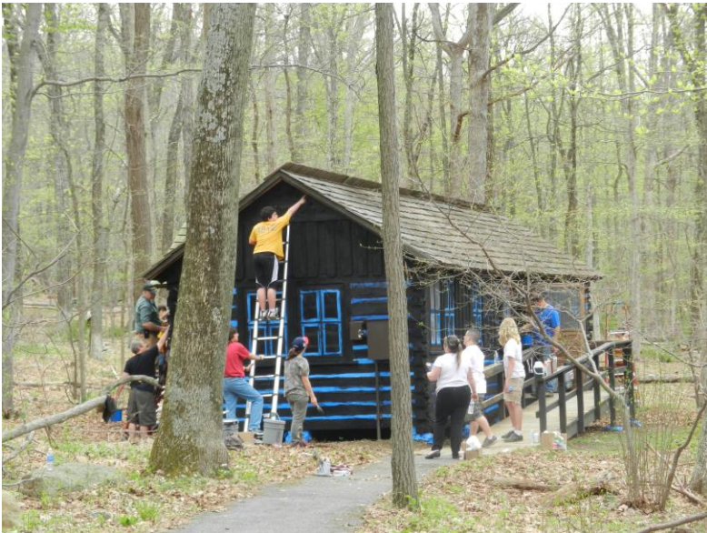
The chinking between the logs received blue painter's tape and then the logs were stained.

Tentatively, next year's Day of Service will be on May 9. So PLEASE pencil this date in on next year's calendar (mine have already started arriving) so you will be available to help.