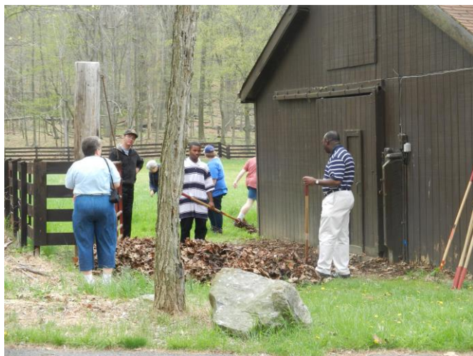
Mulching and raking