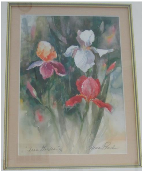
Prize #1 Watercolor print By Rebecca Pearl