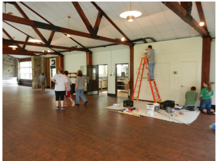
Painting the dining hall.