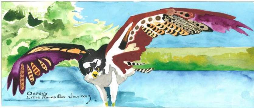
Sketch for Osprey in Many Colors, colored inks on paper

If you have a chance to attend his show, please introduce yourself and thank him for his service to CFA.