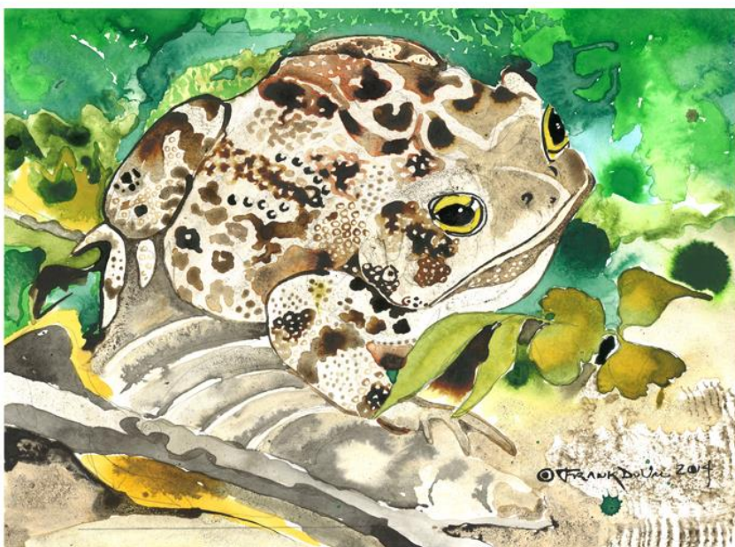
Fowler's Toad at Catoctin State Park, colored inks on paper