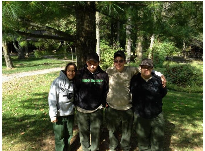
SUCCESS Students Learn to Do Trail Work