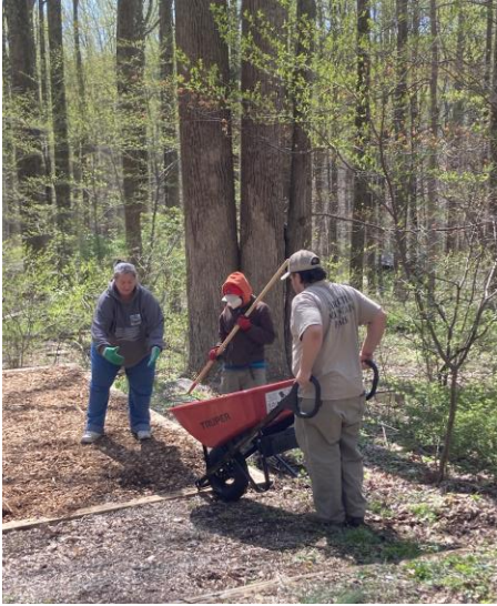
Owen's Creek camp site repair

We have wonderful programs that are running in the parks; Artist in Residence (September 7-28, 2022); the program for the SUCCESS youth working to improve both the Cunningham Falls State Park and Catoctin Mountain Park; and the Amish from Nappanee, IN were here for the month of March.