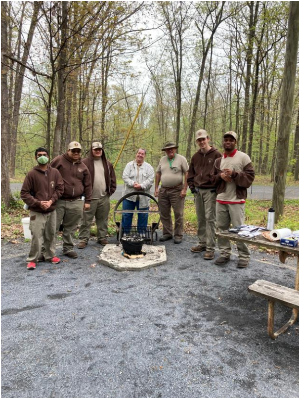
SUCCESS students learn Dutch oven cooking

We are always looking for people to help us grow and help with our programs. You can use the form on the last page of this newsletter to join CFA.