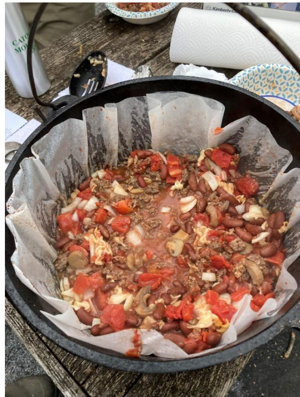
Witch's Brew in Dutch oven - Yum