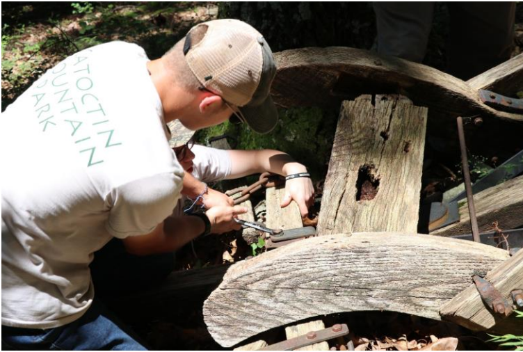
Disassembling the historic charcoal shed