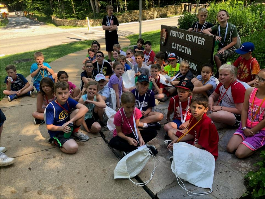
Waiting for the hike to the Blue Blazes Whiskey Still to start.