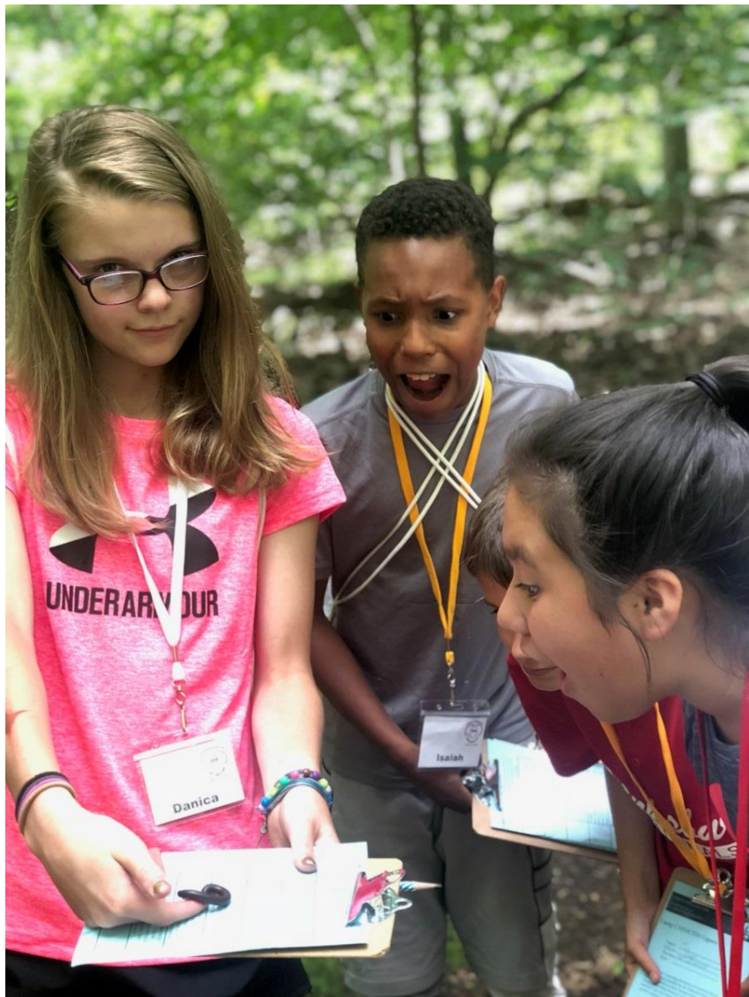
A captured millipede: "Is that thing for real?"