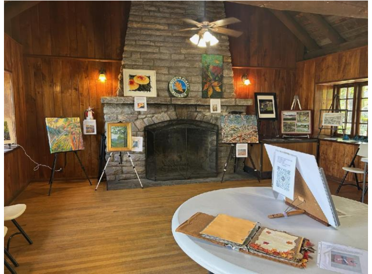
The artwork of the CFA Artists in Residence Program was on display for all the enjoy and purchase.