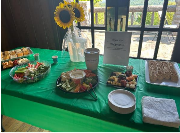
Thank you to Wegman's for their generous gift card and donation