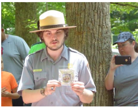
Ranger Cody presents Jr. Ranger badges to the campers

Students assembled to tell the Sassafras story