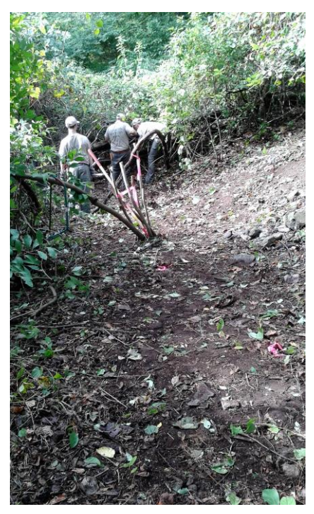
Clearing the Catoctin Furnace Trail