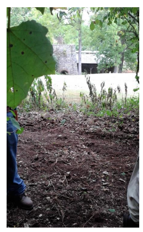
The end of the Catoctin Furnace Trail, cleared by SUCCESS students