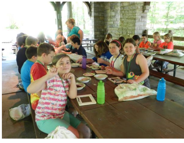
Summer Fun at Camp Catoctin