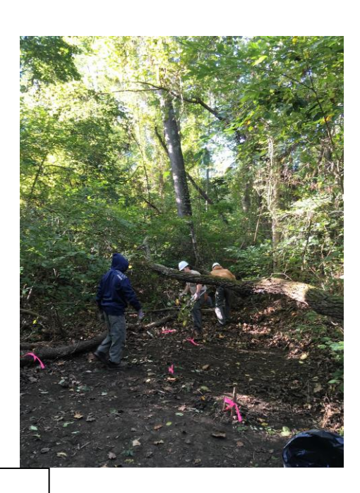
Clearing an overgrown trail