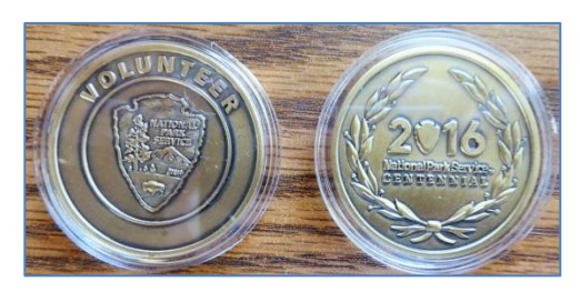
NPS Challenge coins (Obverse and reverse)

National Park Service along with 2016 "challenge" coins in appreciation of service to CMP.