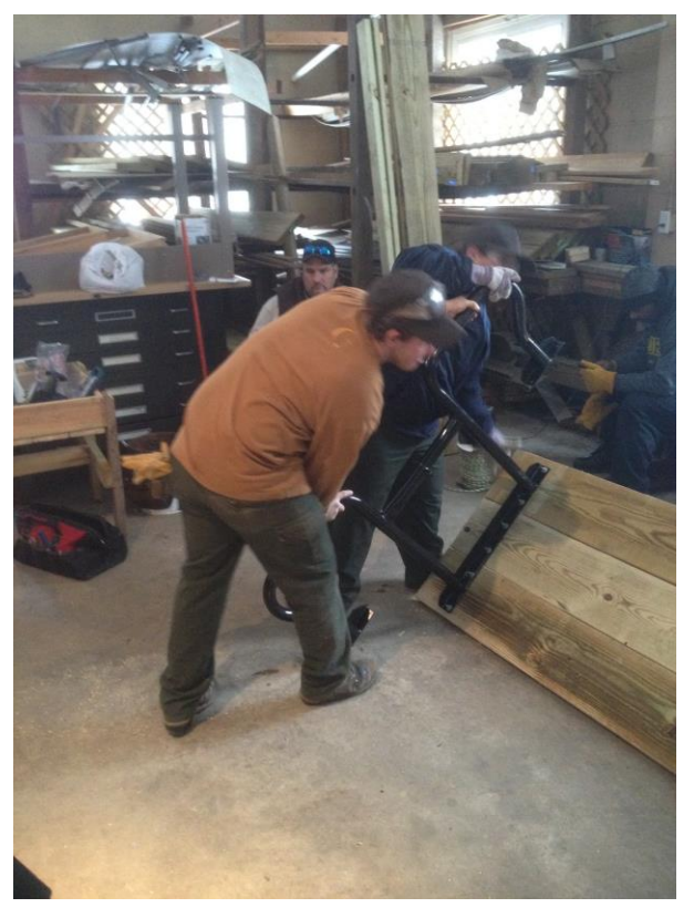
Building picnic tables