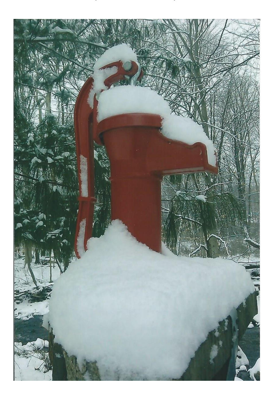
Happy New Year to all.