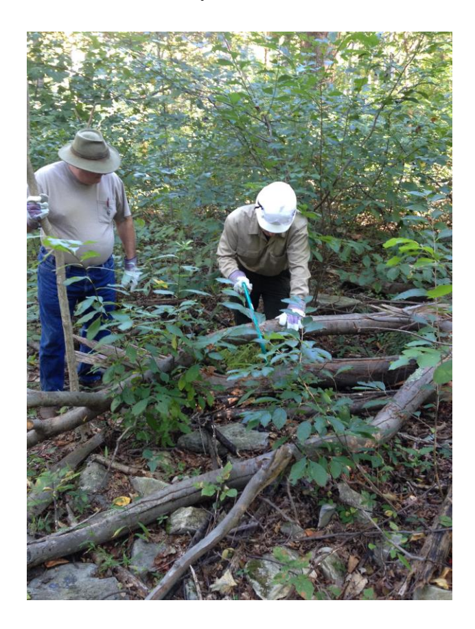
Students learn to use wood cutting tools and do trail maintenance.

With the start of a new year the youth of SUCCESS are busy making picnic tables and planters for the new trail for people with disabilities in the Manor area of Cunningham Falls State Park. The youth meet at Cunningham Falls State Park on Wednesday, Thursday and Friday during the months of January and February. They are also working on sanding and painting items for the March sugar maple festival in Cunningham Falls State Park. The youth meet on Mondays and Tuesdays in Catoctin Mountain Park and during the month of January we will be doing orientation and map reading, February is Dutch oven cooking and in March we will review the tools that we studied last year and start to do trail maintenance work in the Federal and State Parks.