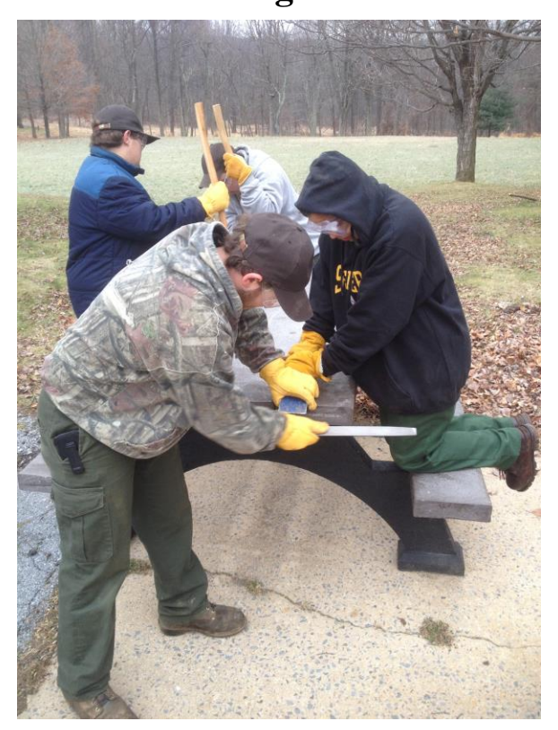
Keeping the axes sharp