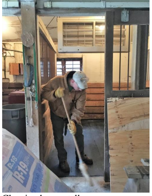
Cleaning horse stalls