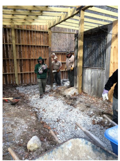
Working at the Aviary at Cunningham Dutch Oven cooking and LUNCH Falls State Park