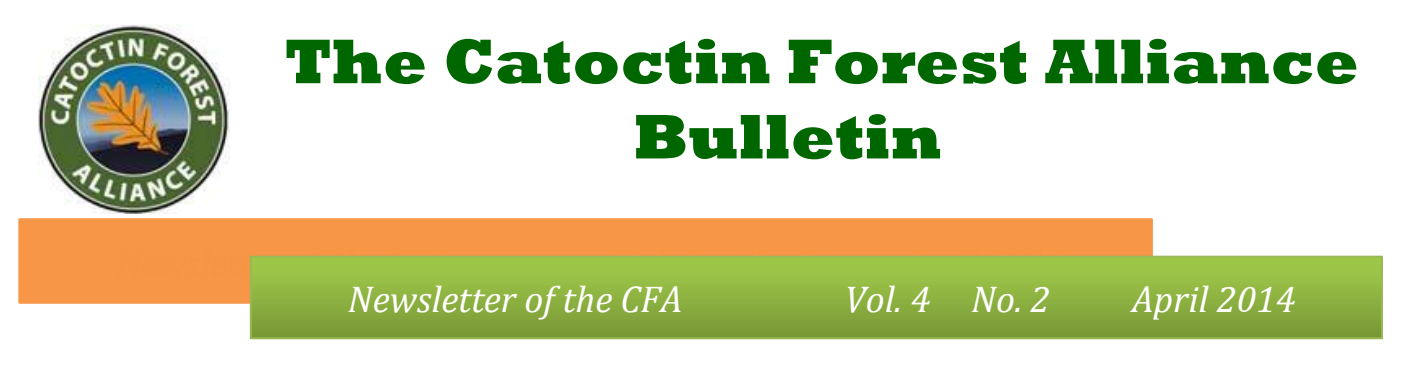
Our mission is to preserve and protect the Catoctin Mountain forest for the benefit and enjoyment of present and future generations