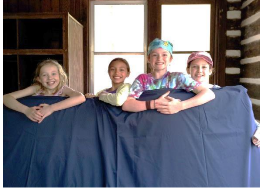
Changing mattress covers at last year's Day of Service

usually such that younger children would not be able to contribute but parents can decide on an individual basis if their child will be able to help and not hinder the work effort.