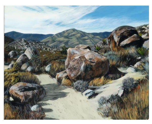
Egg Tempura: Anza Borrego