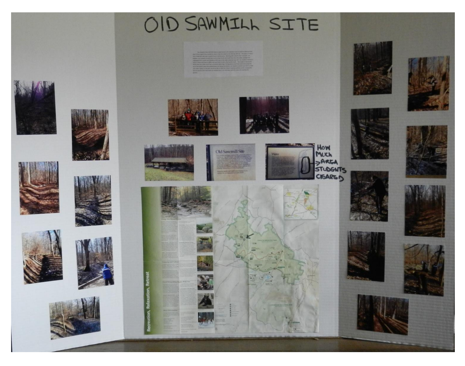
Poster done by the SUCCESS students showing the work they did at the Old Sawmill Site.

The next step for the SUCCESS Project is to establish at 2 year Trail Maintenance Program, where they develop the skills to do trail maintenance in the National Parks and the State Parks. We will be writing grants for the education and pay for the youth. The object is to make these youth valuable assets to the community. Develop a crew of 8 youth and 1 adult by providing education and experience over a 2 year course and then have them become "employed", by being paid through grants, and work in the National and State Parks at no cost to the Parks. It is a big task and all help is greatly appreciated. The more people the less the load.