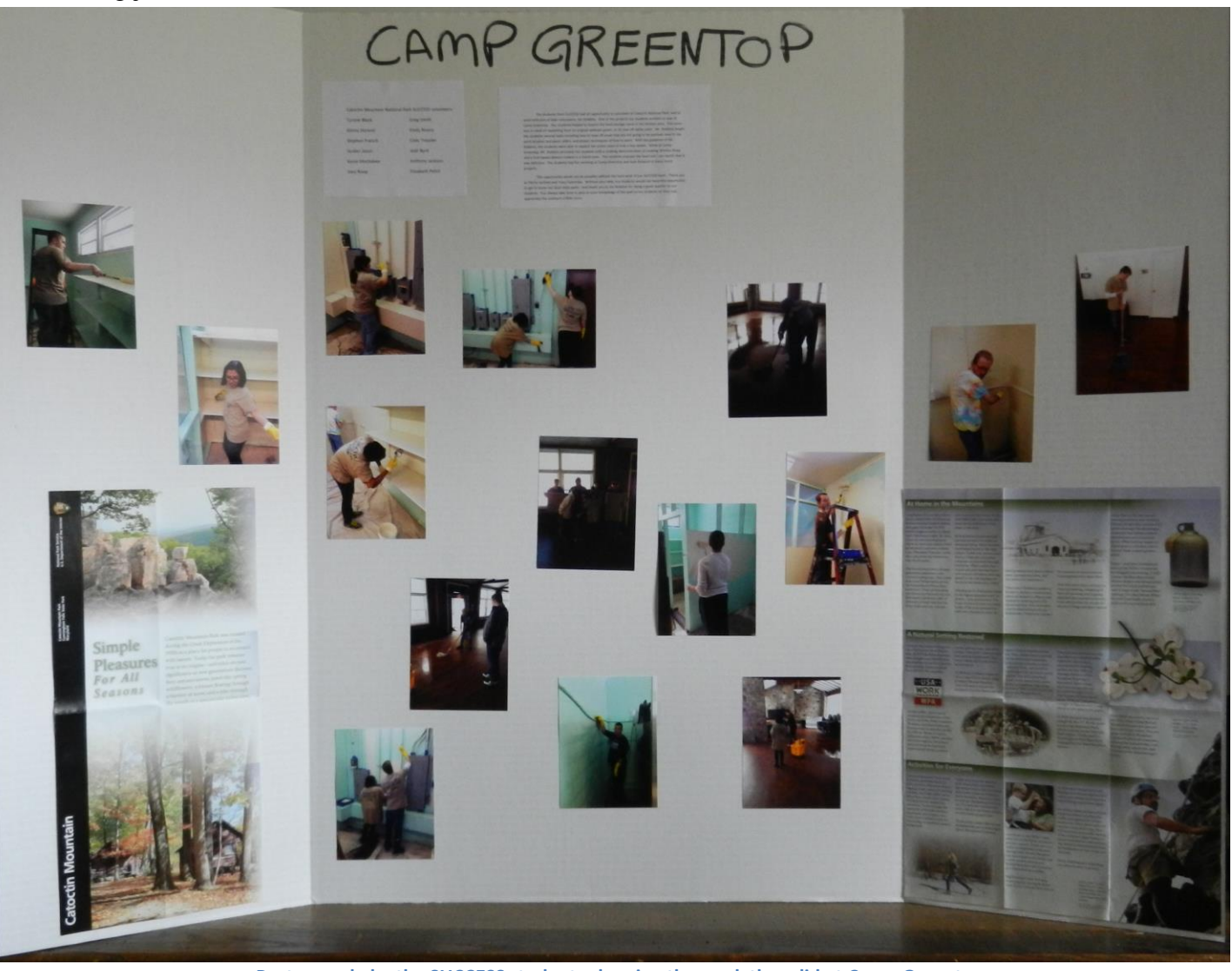
Poster made by the SUCCESS students showing the work they did at Camp Greentop

Well, I know a deep subject, but I think that winter is in the past. During the winter months the youth have been working on painting the mess-hall at Green Top. They did an outstanding job and with the change of the weather we are now outside again. Our new project is clearing the stone wall behind the bank-barn on the Brown Farms Trail. We started about 2 week ago and have made great progress and have about 2-3 weeks to go. The youth had a picnic on Friday (April 11, 2014) at Camp West-Mar and the record is 5 hamburgers and 4 hotdogs. I went to the SUCCESS talent show and it was great and well supported. The youth did an outstanding job.