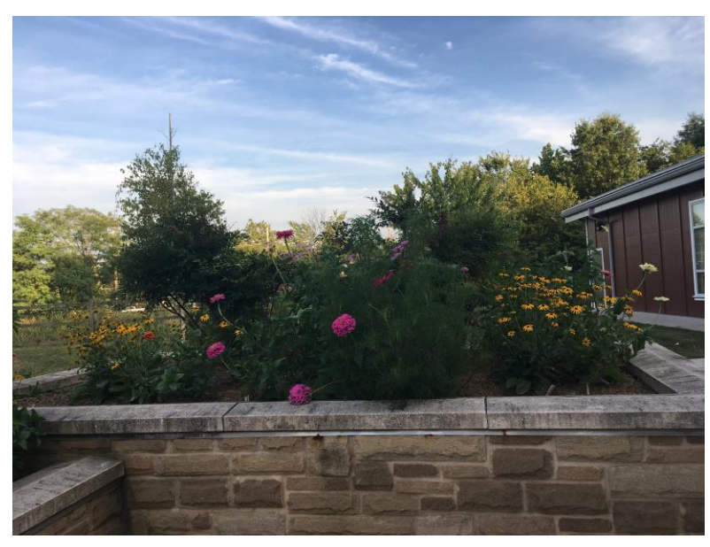
Butterfly gardens at Thurmont Regional Library planted by SUCCESS students and the Thurmont Green Team