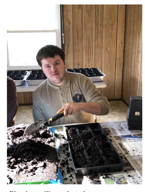
Planting milkweed seeds