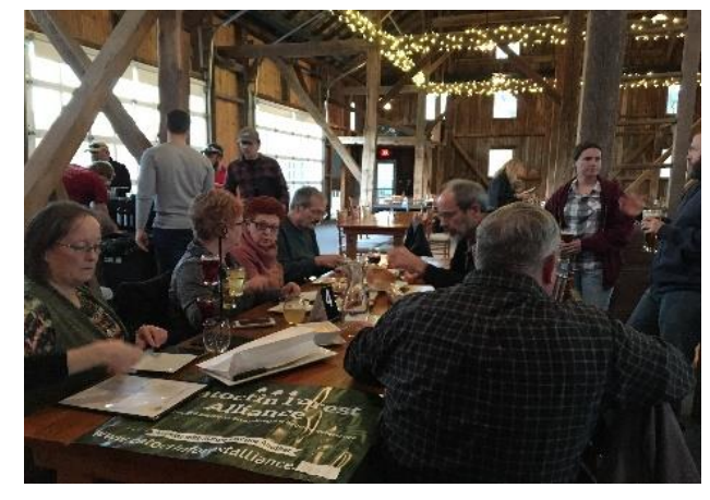
Springfield is a beautiful place to enjoy friends and spend some time together. Scenes from Groundhog Day at Springfield (2019)