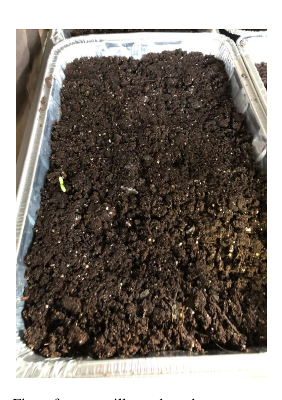
First of many milkweed seeds to sprout