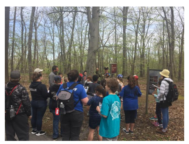
Students enjoy a field trip in the forest.

1200 students here in the park this year! We are very grateful for all the volunteers and the CFA who assist us with this award winning program.