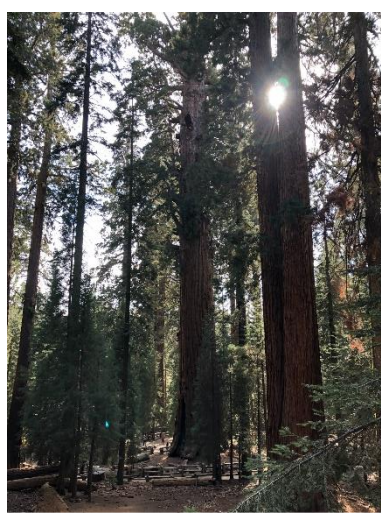
Sequoia National Park