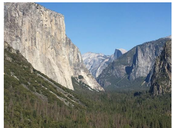
El Capitan & Half Dome (Yosemite)