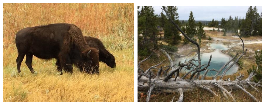
Bison at Custer State Park