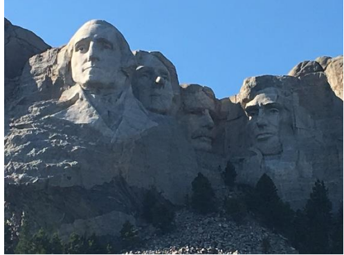
Mt Rushmore National Monument National Park

My connection with the Catoctin Forest Alliance fills me with a sense of profound purpose in encouraging the preservation and sustainability of places like these and our own epic beauties of nature, especially the Catoctin Forest. Therefore, I thought it might be appropriate to share a few of my pictures with you in this CFA newsletter. I hope you enjoy and are left with a sense of appreciation of their beauty in addition to the appreciation for the beauty of our own region.