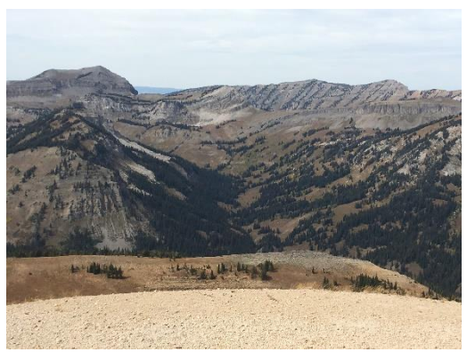
Grand Tetons from atop Teton Village