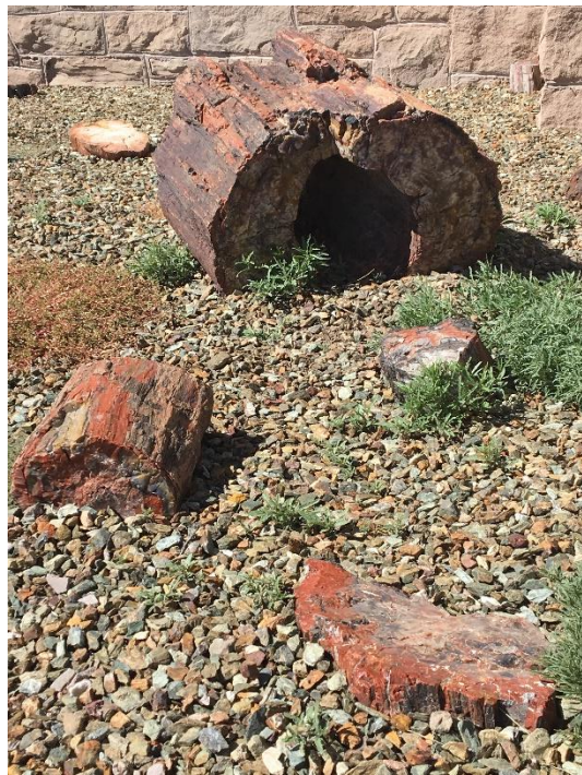
Petrified Forest National Park (Petrified National Forest)