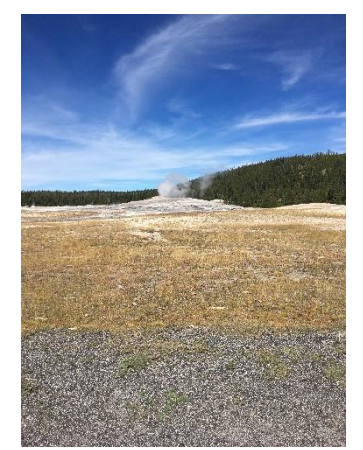
Old Faithful beginning to erupt (Yellowstone)