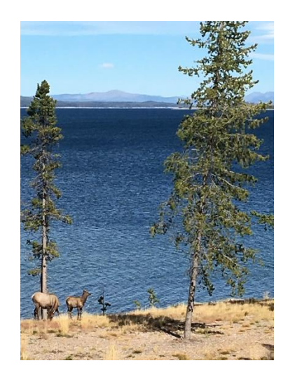
Elk at Yellowstone National Park