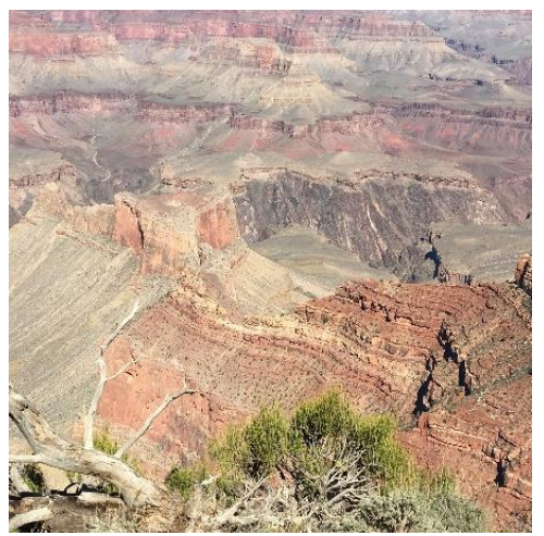
Grand Canyon National Park