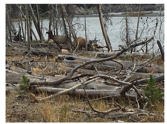
Elk between Yellowstone and Grand Tetons