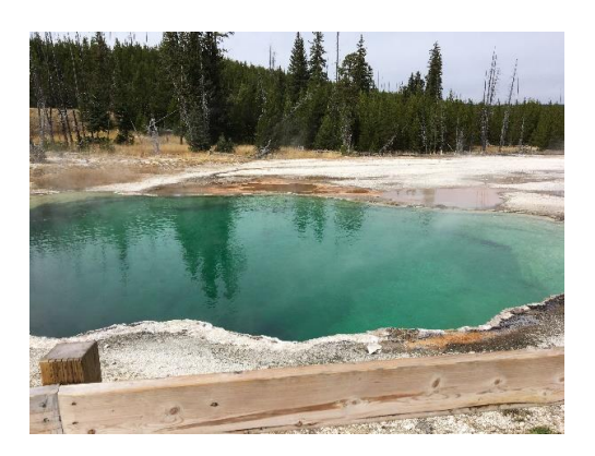
Fumeral at Yellowstone National Park