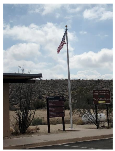
Joshua Tree National Park