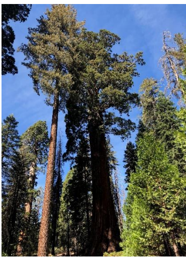
Kings Canyon National Park