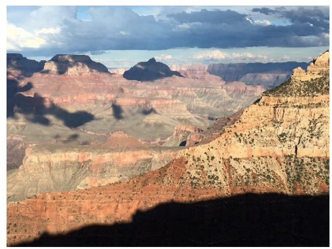
Grand Canyon National Park