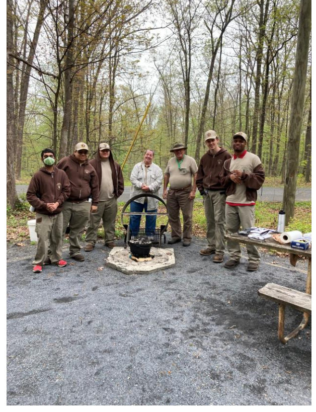
SUCCESS students learn Dutch oven cooking

We are always looking for people to help us grow and help with our programs. You can use the form on the last page of this newsletter to join CFA.