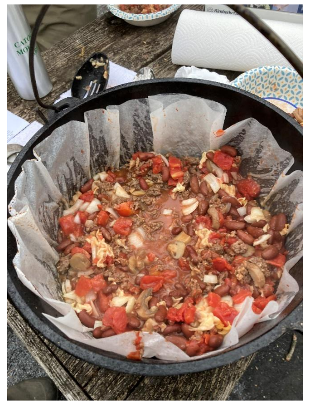
Witch's Brew in Dutch oven - Yum