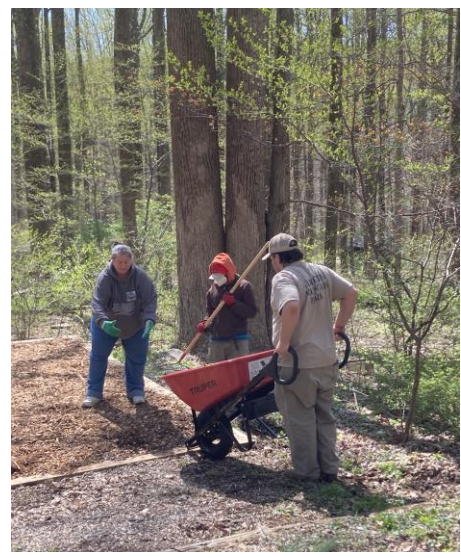
Owen's Creek camp site repair

We have wonderful programs that are running in the parks; Artist in Residence (September 7-28, 2022); the