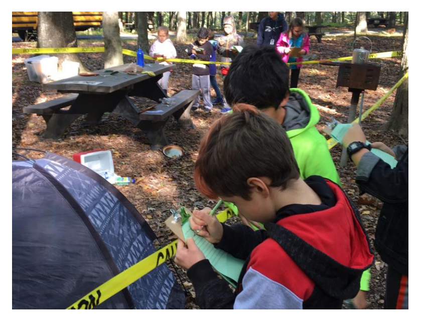
Students at the Crime Scene Caper record their observations