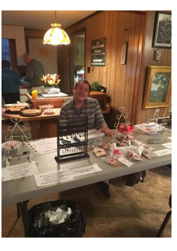
Selling Raffle Tickets at the Open House