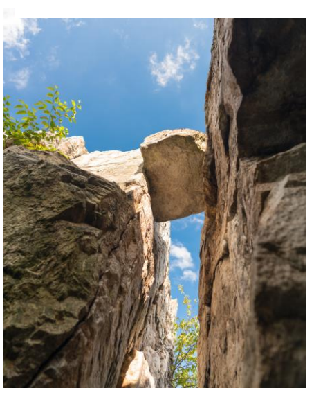
Rock in Crevice at Wolf Rock