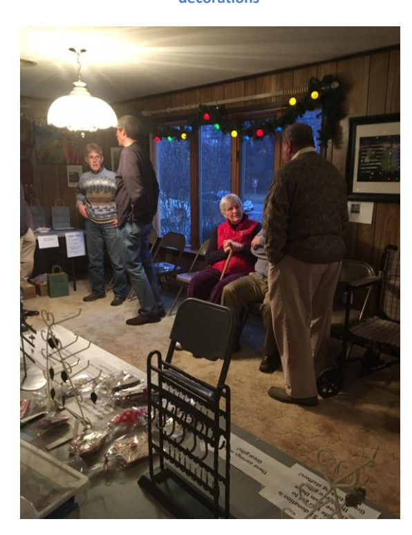
Guests chatting during CFA Christmas Open House