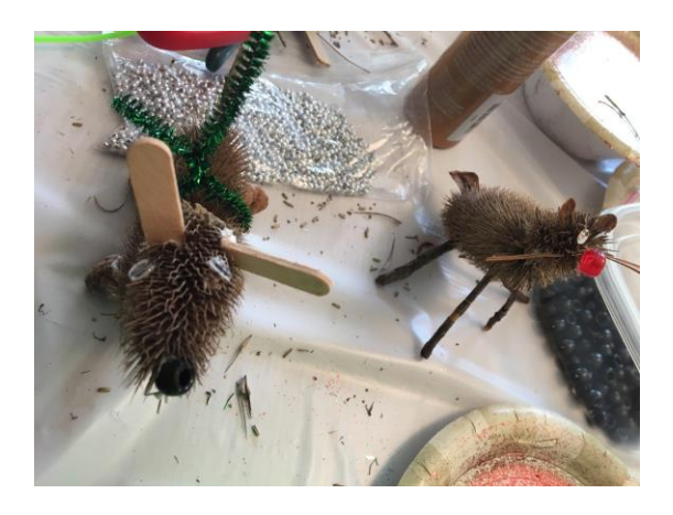
Christmas Critters to give to guests at CFA Open House