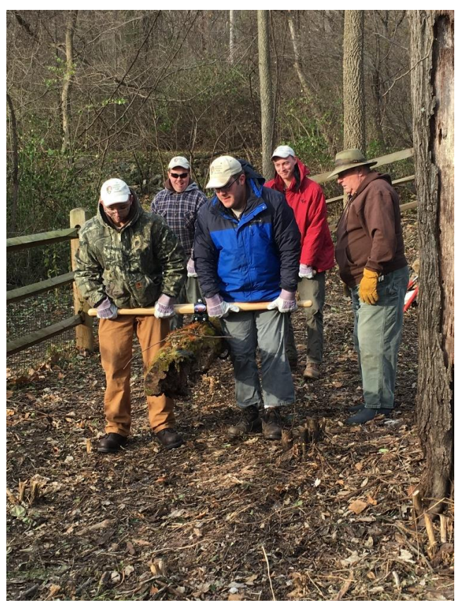
Easy does it. One step at a time.