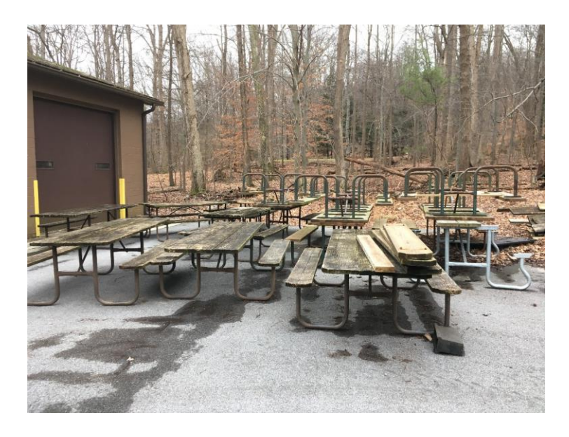
Six picnic tables waiting to be made new