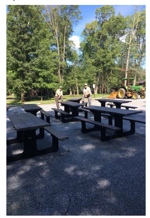
Picnic table repairs completed at Catoctin Mountain Park

The SUCCESS youth have been working hard this fall and into winter. We stayed outside until the weather turned cold. We have been working on clearing brush from the Catoctin Furnace and the Ironmasters House in Catoctin Furnace. We made door decorations to sell for Christmas, worked on some trails and are now rebuilding picnic tables for Cunningham Falls State Park. I really enjoy working with these young men. They not only improve the parks and learn about the proper use of tools but they improve their worth as a member of society as well.