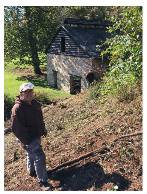
Results of brush clearing at Catoctin Furnace