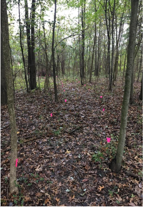
Marking a new trail to the Thurmont Library