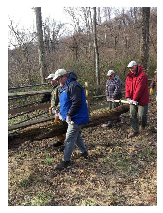
Moving a log with a log carrier at the Ironmaster's House at Catoctin Furnace