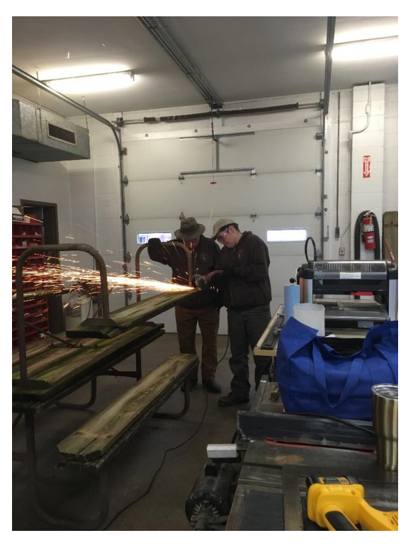
Grinding bolts at the Manor Shop