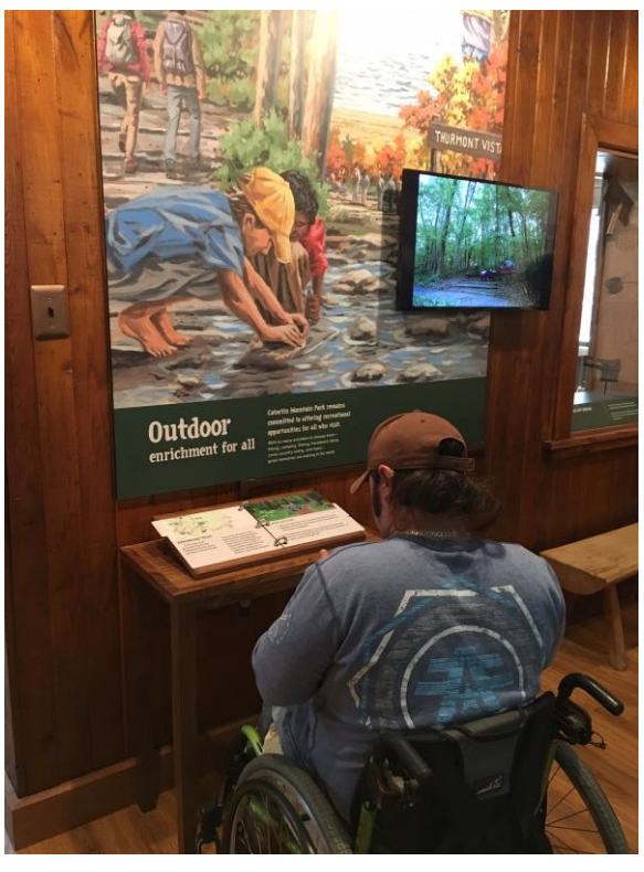
Adults and children alike can enjoy the new exhibits.

The exhibits have engaging interactive elements for children and adults to learn about the animals, plants and people who lived in and visit the park. The exhibits are open daily 9-5. Stop by for a visit.