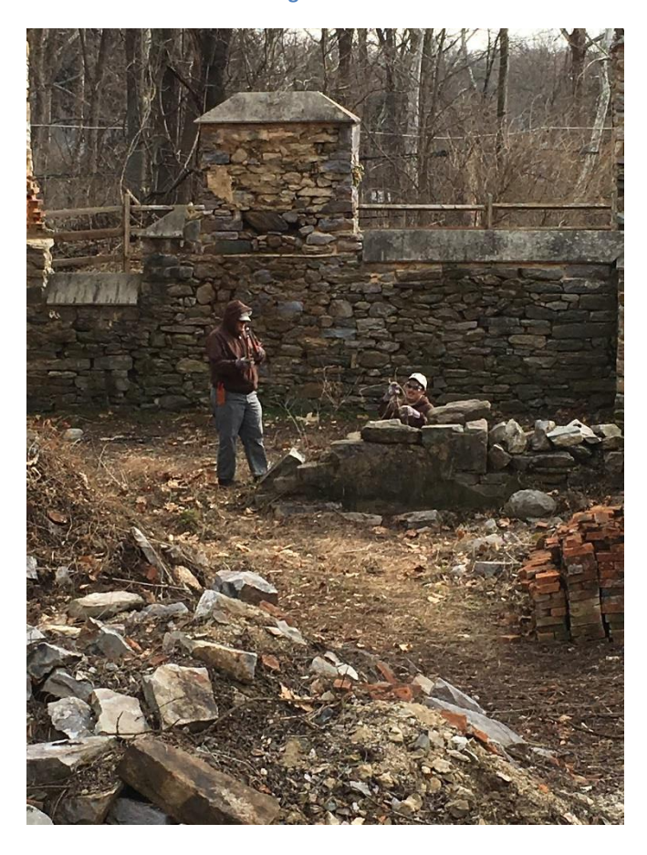
Finishing clearing brush at the Ironmaster's House.