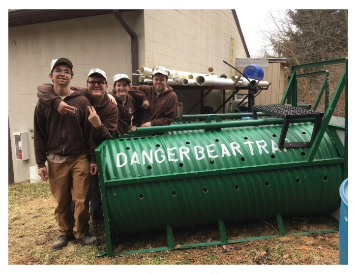
What can I say?!

Clearing brush on Thurmont Library Trail for a flower bed.