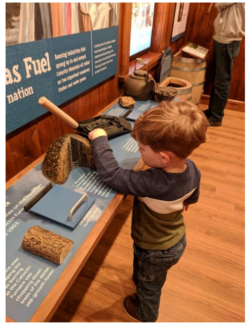
Young child examines models in the new exhibits.