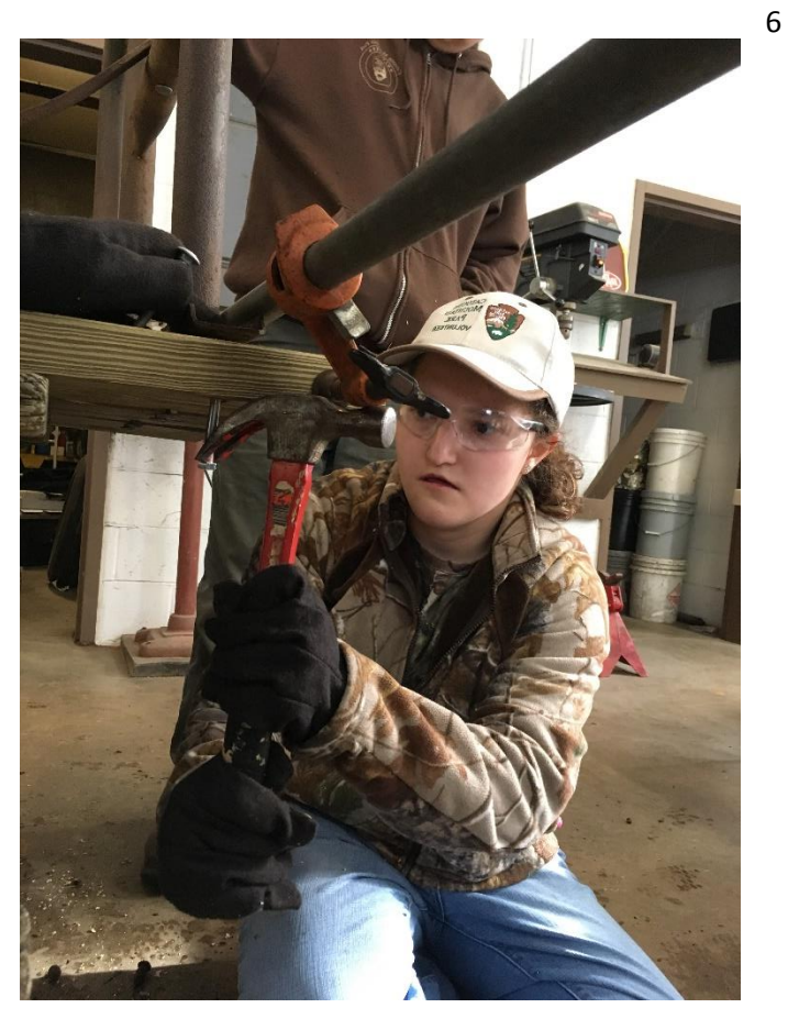
Repairing picnic tables at the maintenance shop Manor Area Cunningham Falls State Park