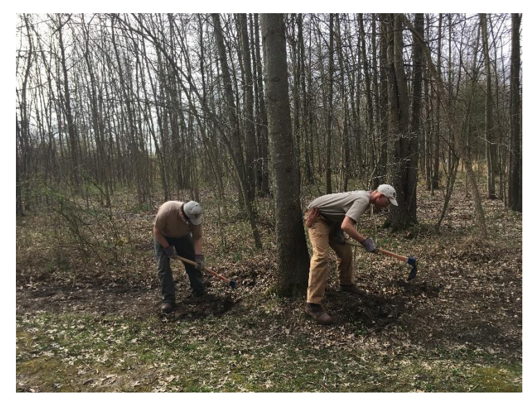
Working on new trail at the Thurmont Library.