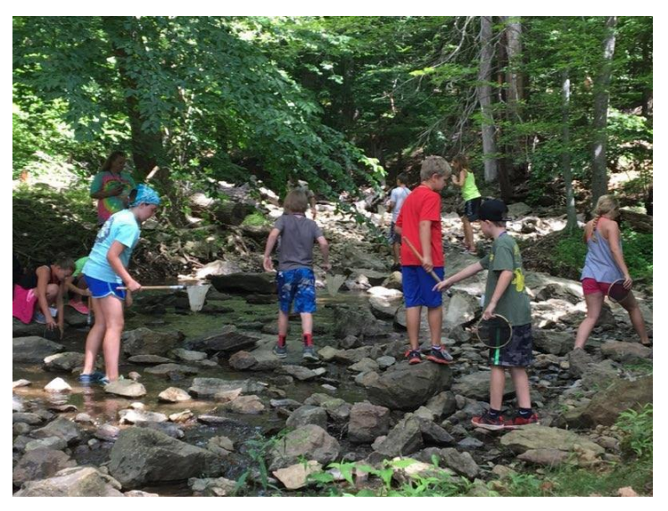
Catching fish and other critters in a stream