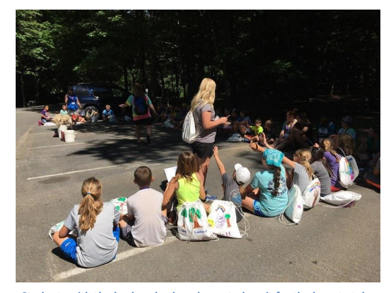
Students with the backpacks they decorated, wait for the buss to take them home after camp.